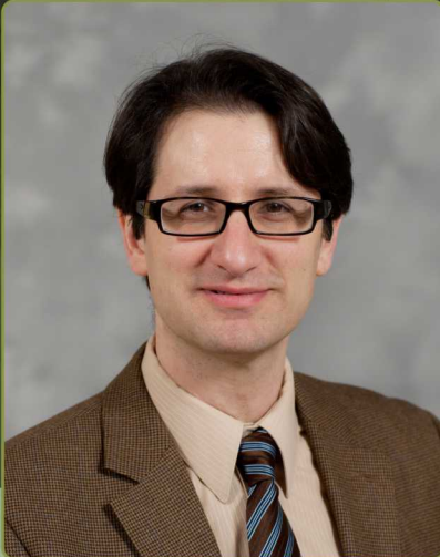
Georgia Institute of Technology